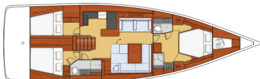
3 cabins + 2 heads